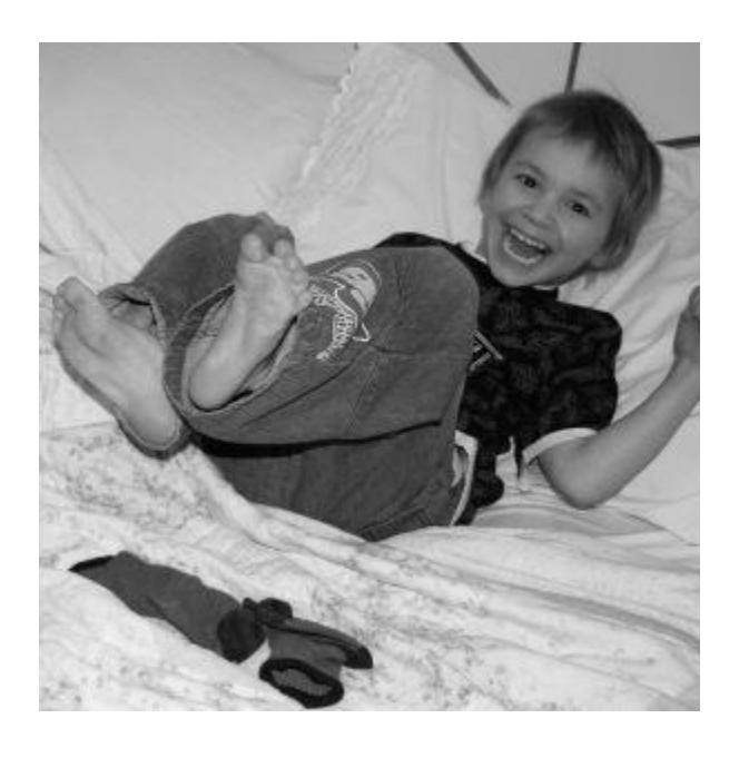
Discipline Dynamics A Helpful Guide To Positive Discipline Methods

Everyone needs to have some form of discipline embedded into their lives to create a smoothness that will help the person function in an acceptable manner. Most of these discipline elements are adopted from a very young age and usually initiated by the parents of the child. In order to teach the child how to eventually simulate into society and be manageable, these discipline measures are necessary. Get all the info you need here.